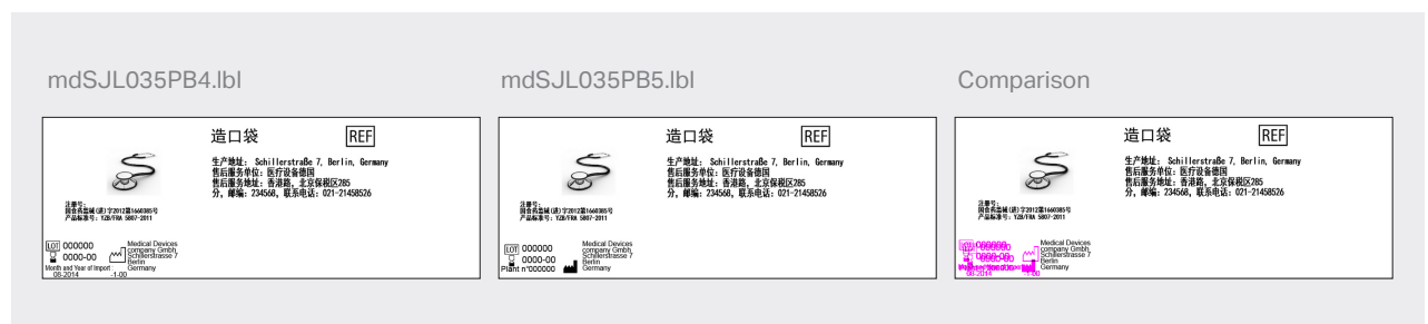
Figure 1: Label comparison example.

NiceLabel's 64-bit Automation Labeling Service Bus provides real-time integration with the Company's MES and SAP environments. In addition, integration with SAP allows the Company to deploy label formats and workflow configurations in a development environment, move them to QA for testing and validation, and ultimately shift to production based on a controlled schedule.